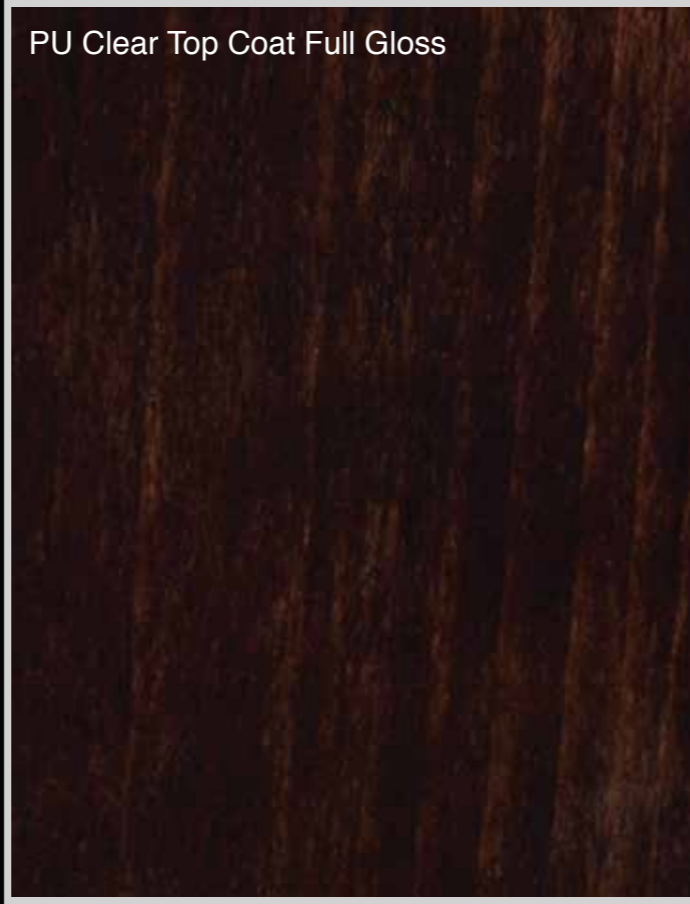
PU Clear Top Coat Full Gloss