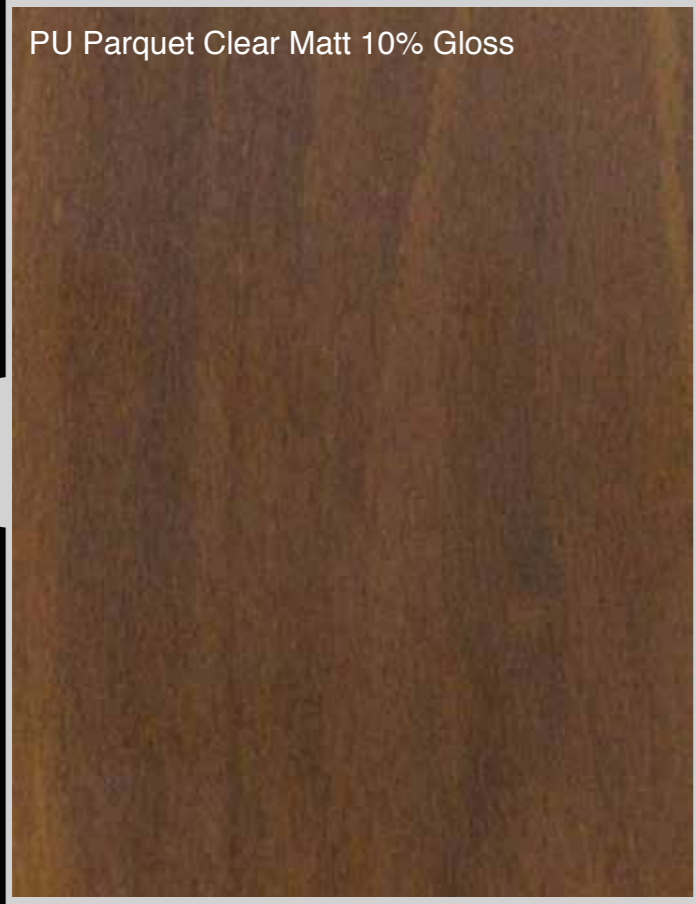
PU Parquet Clear Matt 10% Gloss