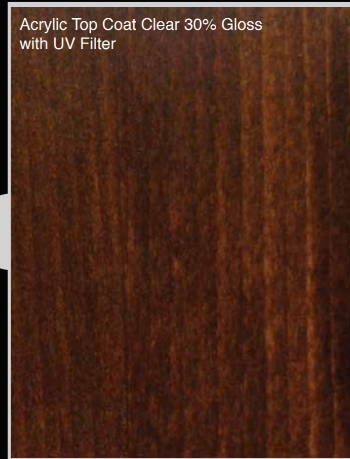
Acrylic Top Coat Clear 30% Gloss with UV Filter