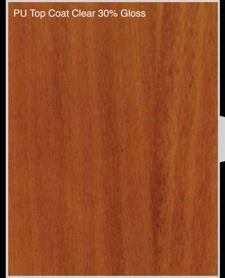
PU Top Coat Clear 30% Gloss