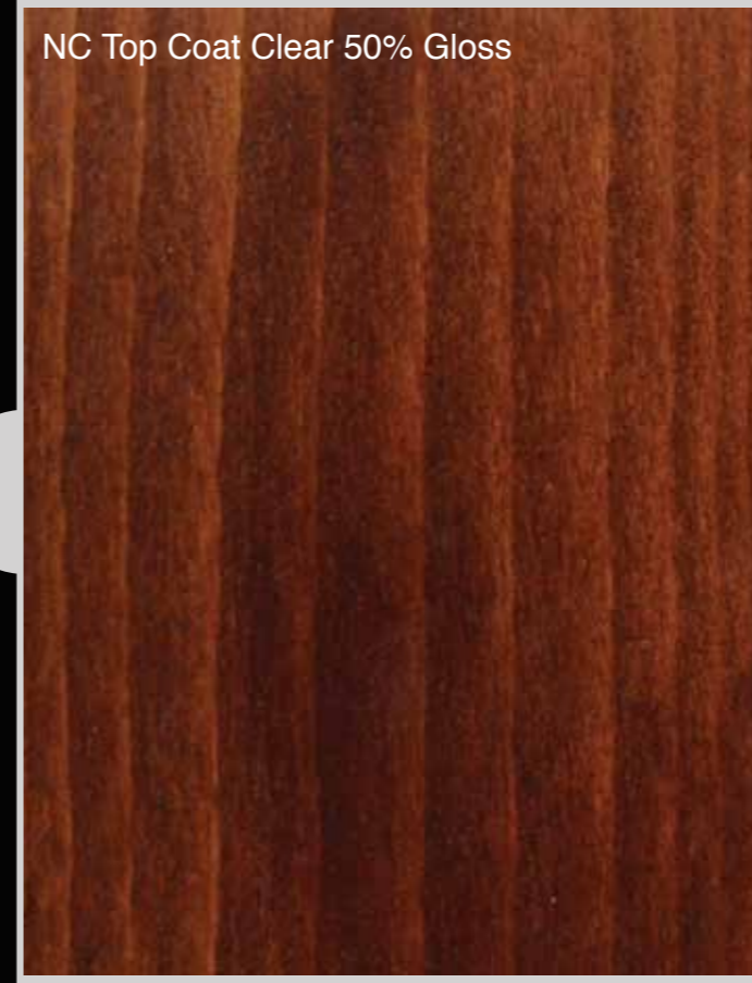
NC Top Coat Clear 50% Gloss