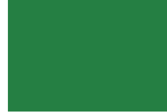
RAL 6032 - Signal Green