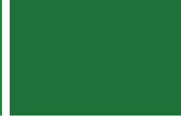
RAL 6001 - Green