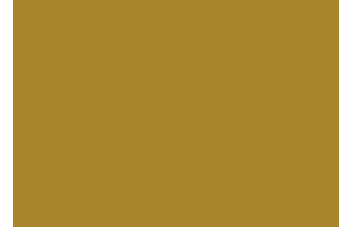
RAL 1005 - Buff Yellow