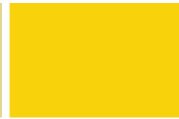
RAL 1023 - Traffic Yellow